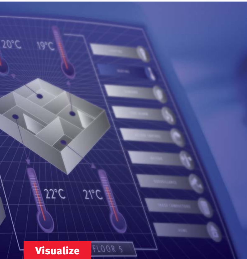
Visualize FLOOR 5